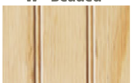
W - Beaded