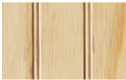
W - Beaded